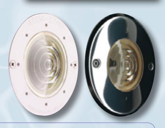
standard & optional stainless steel trim ring

Spectrum Series LED Pool Lights combine all the modern, compact and unobtrusive features of the proven Aqua-Star system with LED colour changing technology to add that WOW factor to your pool.